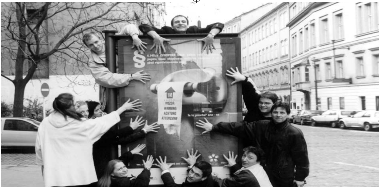
ICN team by the city light poster "30 days for the Civic Sector"