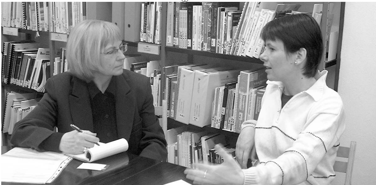
ICN library is also a place for exchanging experiences among NGOs staff

resources for non-profit organisations. At the end of the year, the DBFZ project was supported by the Civil Society Development Foundation within the Civil Society Development Programme funded by EU Phare . In the spring of 2002, the DBFZ will be ready to start operating via the Internet – non-profit organisations' employees could start using its information during the second quarter of 2002.