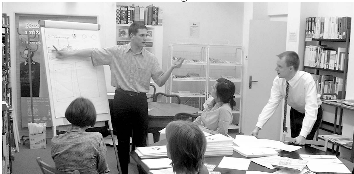
ICN team – discussing new webpages

collection of basic information on the non-profit sector from ICN and regularly update it. Some libraries map non-profit organisations in their surrounding towns, actively participate in the organisation of activities (e.g. providing premises for meetings or exhibitions). Most libraries have already started to provide the targeted services, i.e. they make their own search of suitable recipients for the acquired information. All libraries are equipped with a computer for access to the Internet.